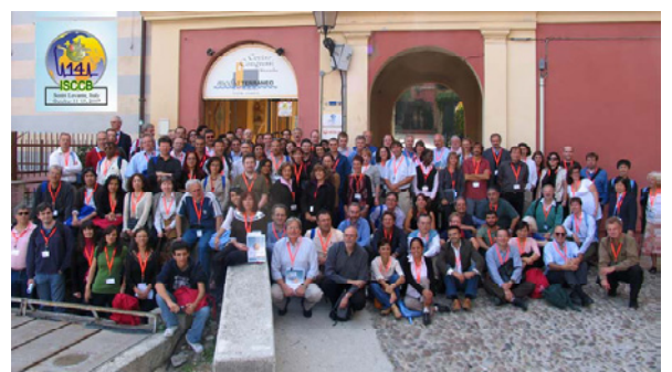
Attendees of the ISCCB in Sestri Levante, Italy.

Recap of Catecholamine-Related Symposia during 2007: This past year saw several important symposia of relevant interest to investigators with catecholamine-related interests. At the end of May there was the Dopamine Conference held in Göteborg, Sweden, which was followed in mid June at Smolenice Castle 9<sup>th</sup> (Slovakia) bv the Symposium on Catecholamines and other Neurotransmitters in Stress. Then in August there was the Gordon Research Conference on Catecholamines held at Oxford in the United Kingdom, which was followed in October by the 14th International Symposium on Chromaffin Cell Biology (ISCCB) held at Sestri Levante, Italy.